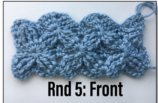
Rnd 5: Front

Row 5: (This row is very similar to row 1) Ch 4. 3 Tr in first sc, ch 1, * sc in sc from previous row, ch 1, in FpTr 6 tog joining loop work 3 Tr, ch 3, 3 Tr, ch 1.* Work across. In previous row's turning ch work 4 Tr in the 3rd ch.