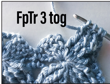
FpTr 3 tog

Row 4: Ch 4. Skipping the ch and only working Tr posts, FpTr 3 tog { There will be 4 loops on hook after doing the FpTr 3 tog, yo and draw through all 4 loops }, ch 5, * sc in ch 5 sp, ch 5, FpTr 6 tog, ch 5.* Repeat from * to * across. Sc in ch 5 sp, FpTr 3 tog on last 3 tr from previous row. Ch 4, sc in last sc. Turn