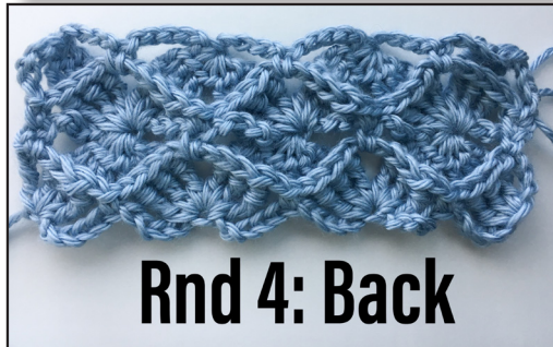
Rnd 4: Back

Row 5: (This row is very similar to row 1) Ch 4. 3 Tr in first sc, ch 1, * sc in sc from previous row, ch 1, in FpTr 6 tog joining loop work 3 Tr, ch 3, 3 Tr, ch 1.* Work across. In previous row's turning ch work 4 Tr in the 3rd ch.