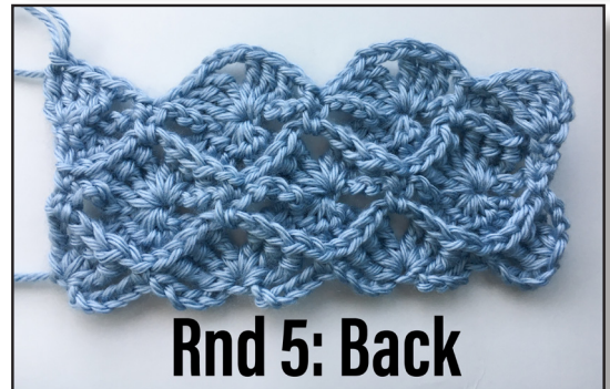
Rnd 5: Back