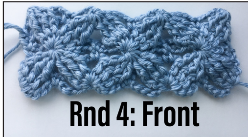
Rnd 4: Front